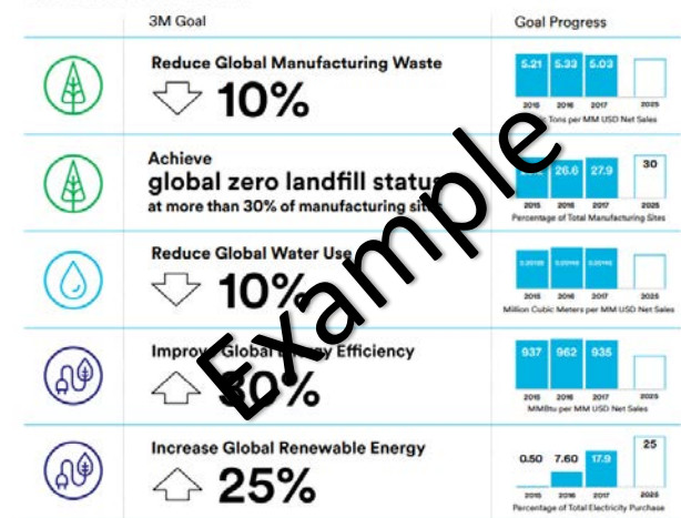
2025 Goals Scorecard