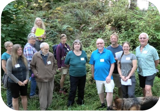
Heritage Select Committee in front of the heavily overgrown remnants of a Highlands Lime Kiln near the municipal office.