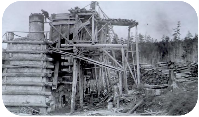
This photo from Texada Island shows how BC lime kilns appeared in the late 1800's