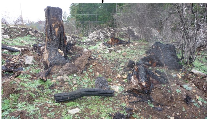
A very fast response time prevented this fire on Millstream Lake Road from quickly spreading to adjacent forests and properties.