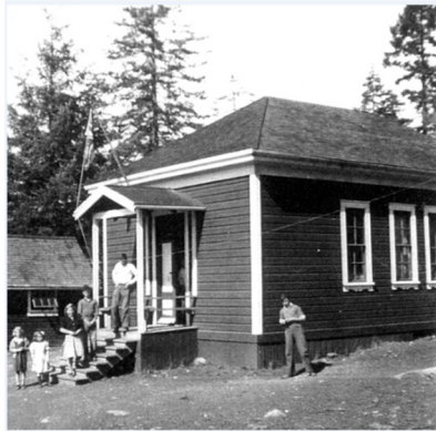
The Old School House

Highlands Community Museum Caleb Pike Heritage Park 1589 Millstream Road