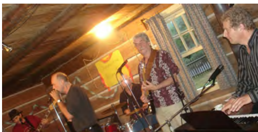
Caleb Pike House - 7:30 PM 1589 Millstream Road