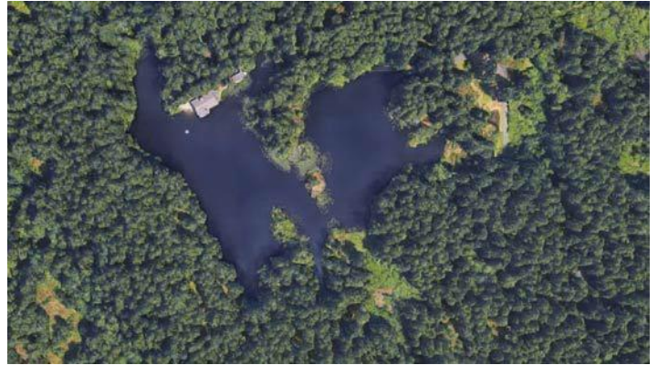
Aerial View of W̱MÍYEFEN Nature Sanctuary